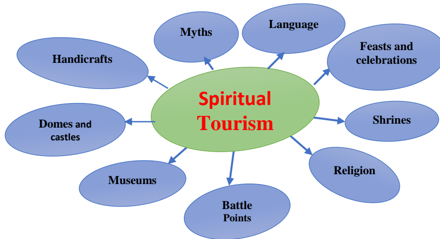
Fig. 3. Important factors in the creation of tourism spirituality

At the end of the research and in the following figure, the important elements that have played role in the creation of tourism and spirituality, followed by the development of peace on a variety of scales are pointed out as follows: