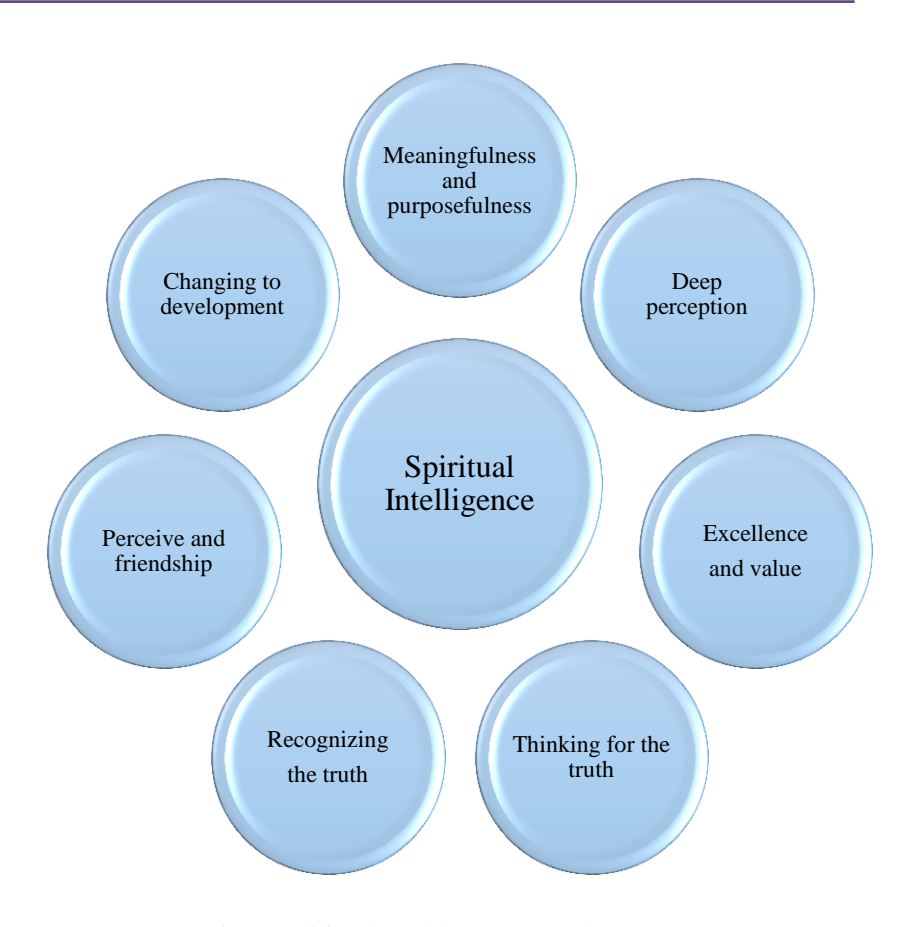
Fig. 2. Spiritual Model

Based on the researches carried out by various scholars, tourism has significant concepts for the majority of people, and can be form the great deal of people's life (Franklin & Crang, 2001; MacCannell, 1973; Uriely, 2005). Tourism not only is a physical concept, but also includes a set of spiritual experiences (McIntosh & Mansfeld, 2006; Smith, 2003). Travelling is not merely a pointless issue. Travelling causes people to be rich in experience and conceptual matters and apart them from routine. Nowadays, scholars identify travelling more than just a physical experience. The aforementioned experience can be spiritual which involves altruism, personal interests, cognitive, and changes in life, simultaneously (Wilson & Harris, 2006). Tourists are contributors